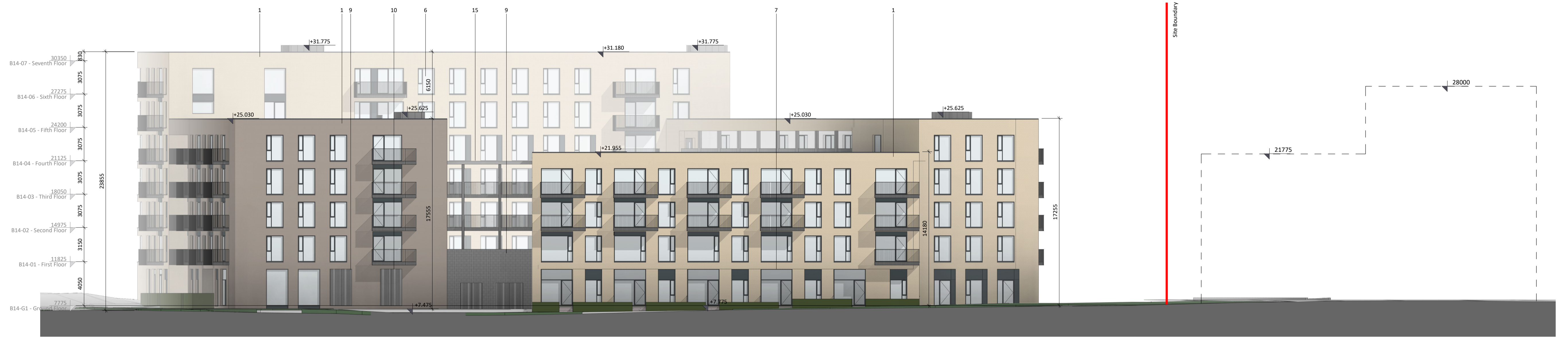
1 B14-South East Elevation 1:200

Block 10, development permitted by ABP-301991-18 (as amended by ABP-310378-21). Not yet built.