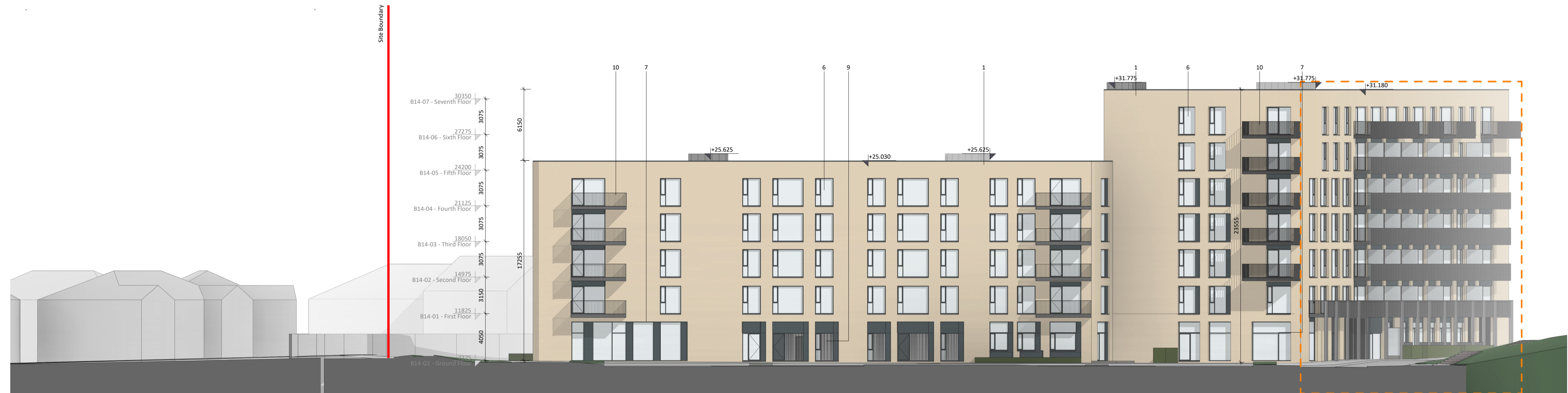
2 B14-North East Elevation 1:200

Block 10, development permitted by ABP-301991-18 (as amended by ABP-310378-21). Not yet built.